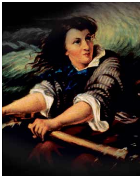
Grace Darling by Thomas Brooks, c1866.