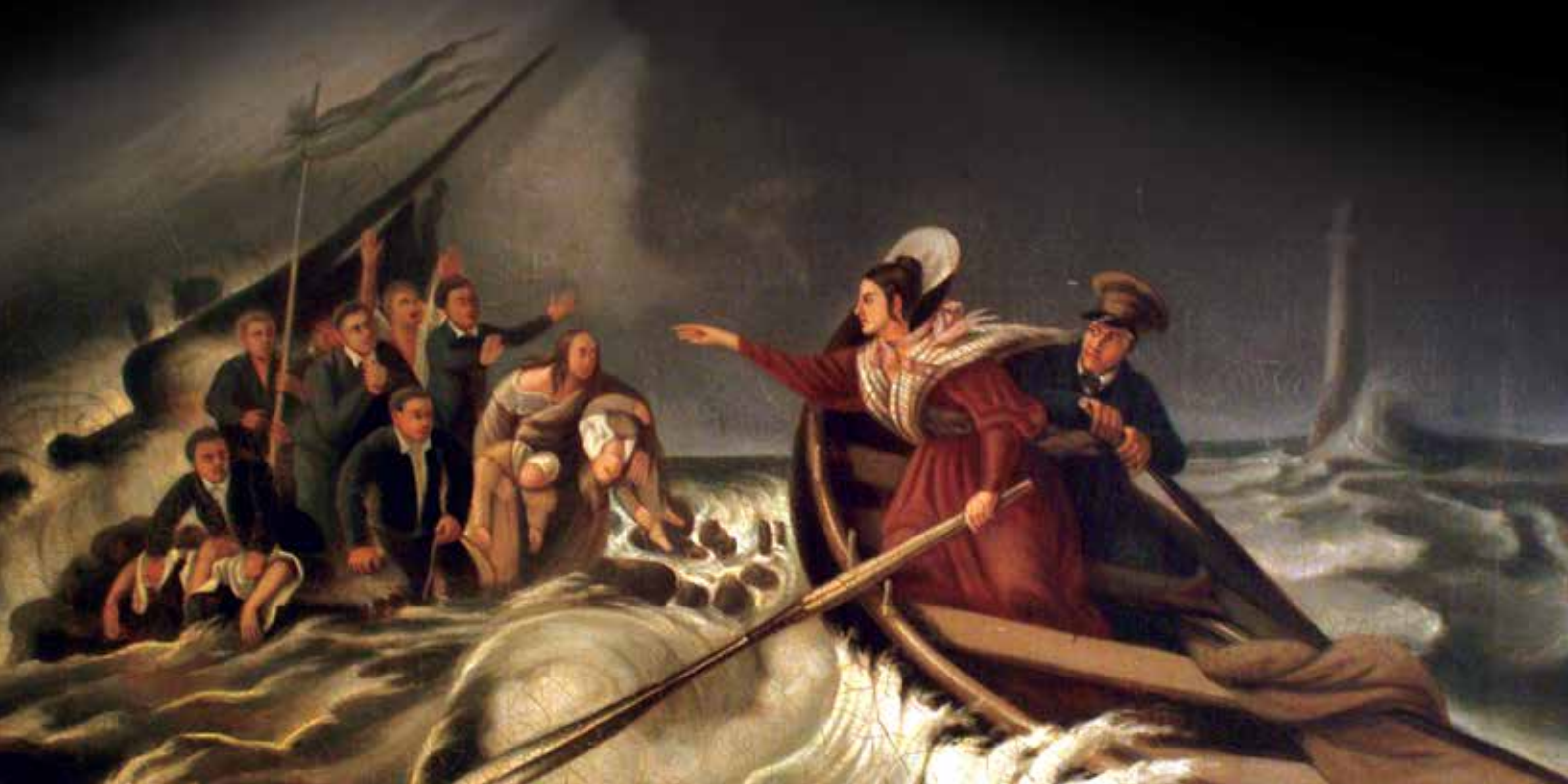
The Rescue of the Forfarshire , after FS Lowther, c1840.